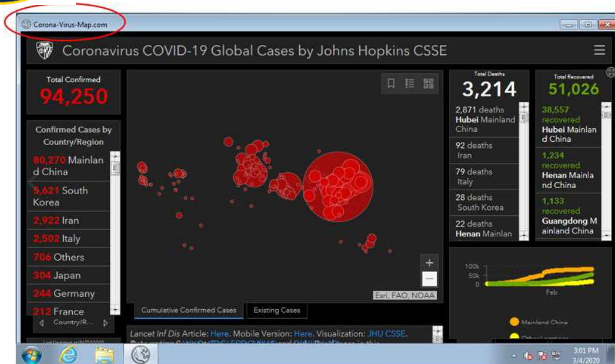
Figure 1. Screenshot of the malicious website "Corona-Virus-Map[dot]com" pretending to be a legitimate COVID-19 tracker.